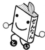
Library Mascot 《Tokosho》