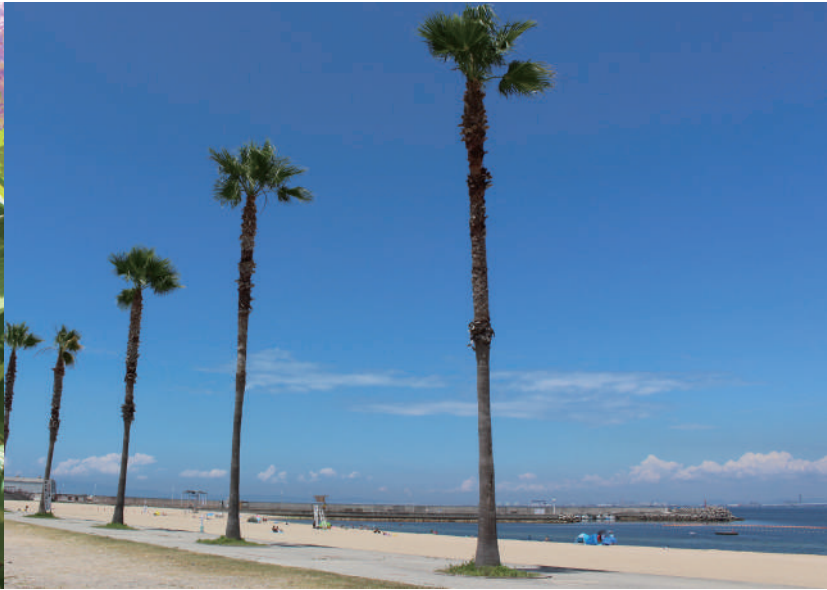
6. Tarui Southern Beach

4. The largest fireworks show in western Japan. The sparkling buds of fireworks above Osaka Bay are a must-see.