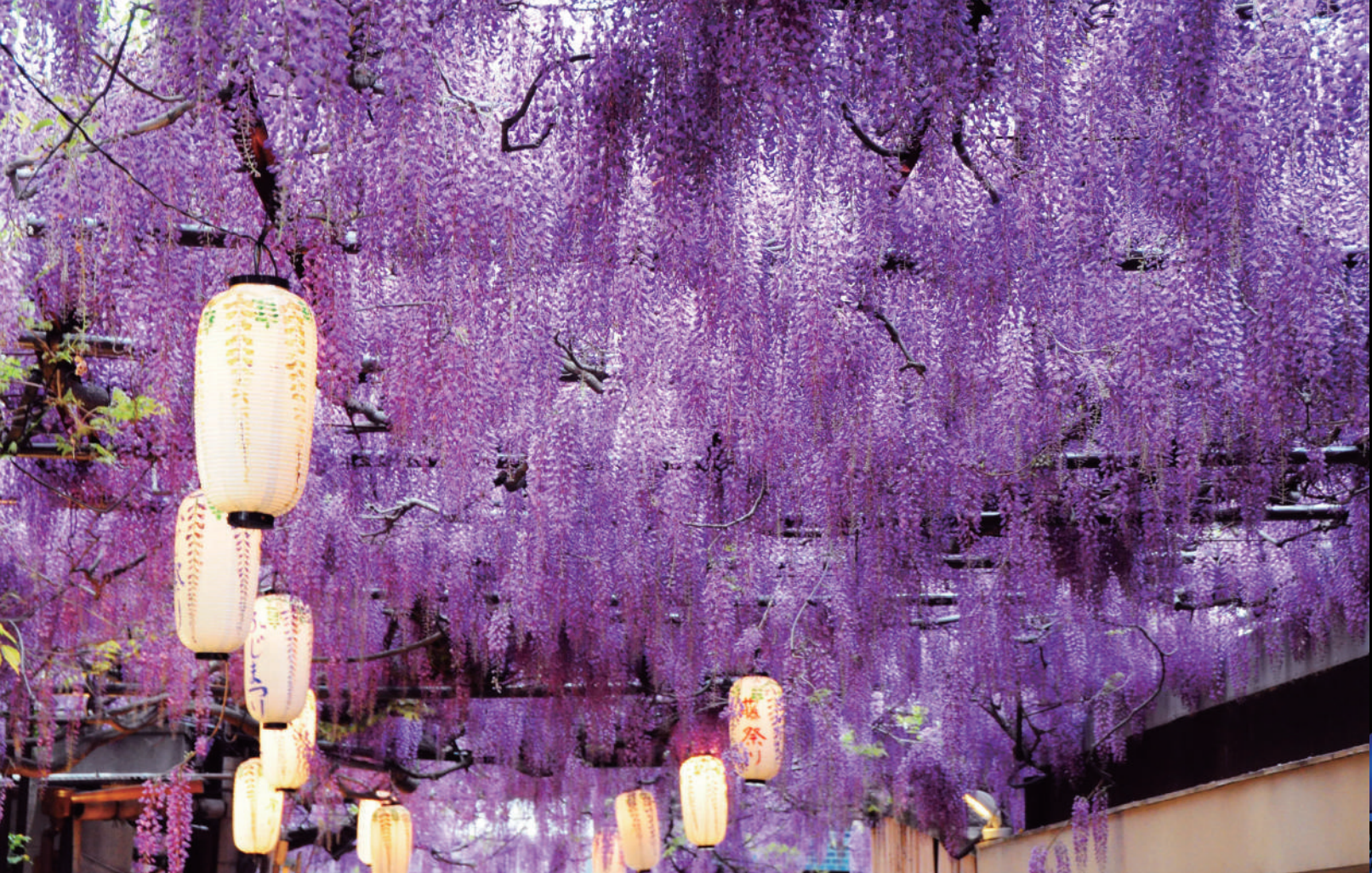
1. Wisterias of Shindachi-shuku, once a post town at the Kumano-kaido Road