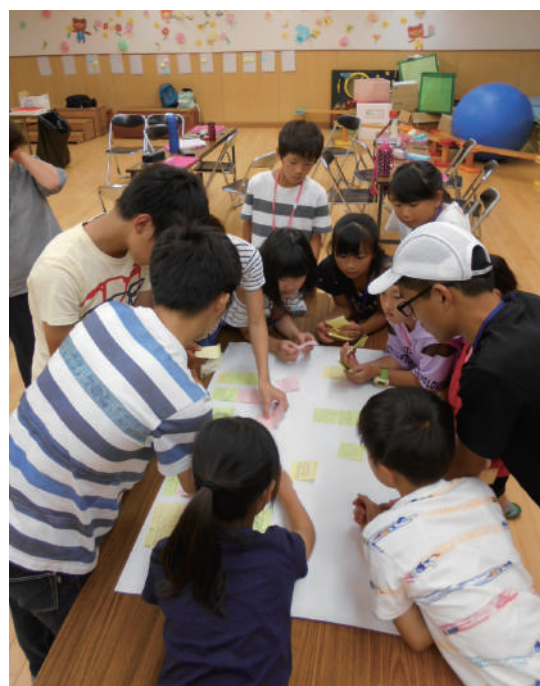
↑ Sennan Children's Conference

It provides education on the Rights of the Child and space to freely talk about their respective communities and schools. We aim to become a city that reflects our children's hopes and aspirations.