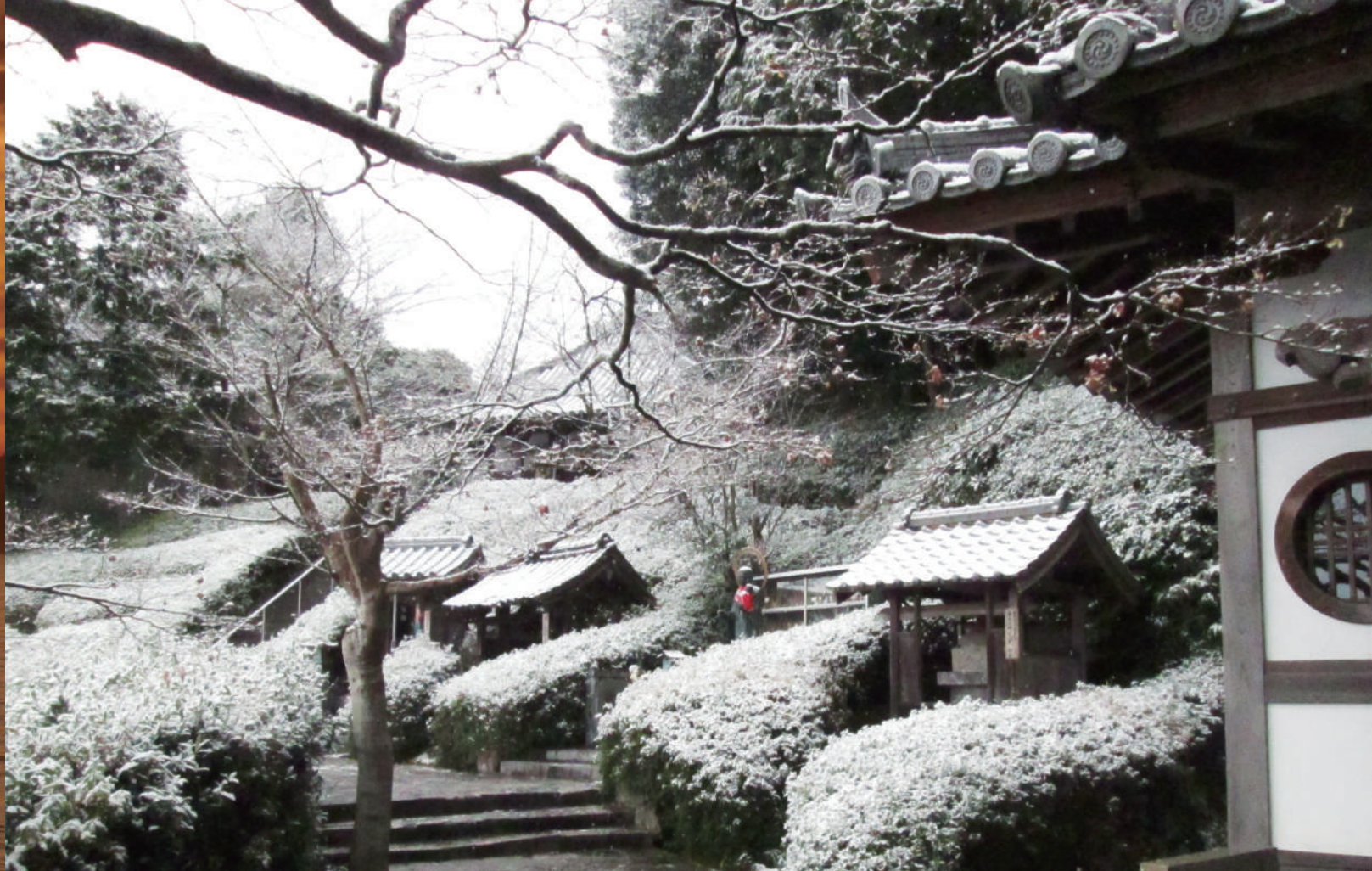
10. Winter Landscape at Rinshoji Temple