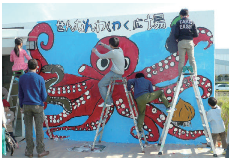
← Wall art made by children to beautify the city and prevent graffiti