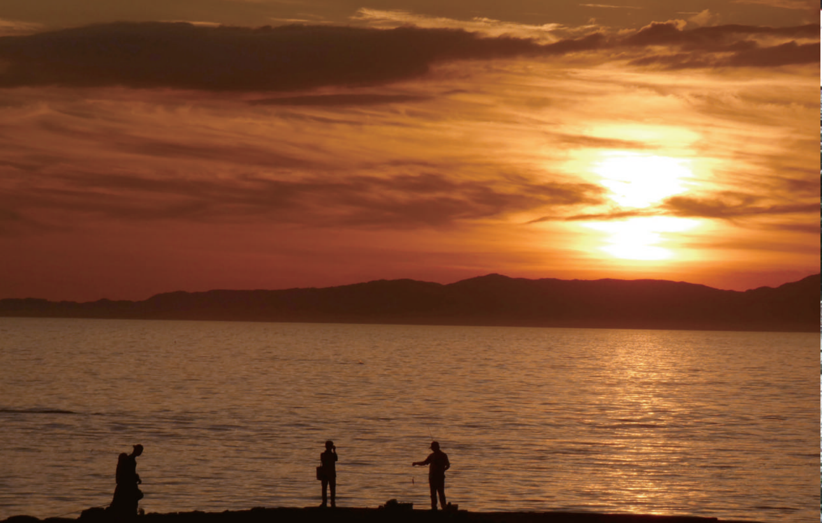
7. Sunset at Sennan Marble Beach