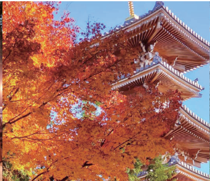
9. Autumn leaves at Chokeiji Temple