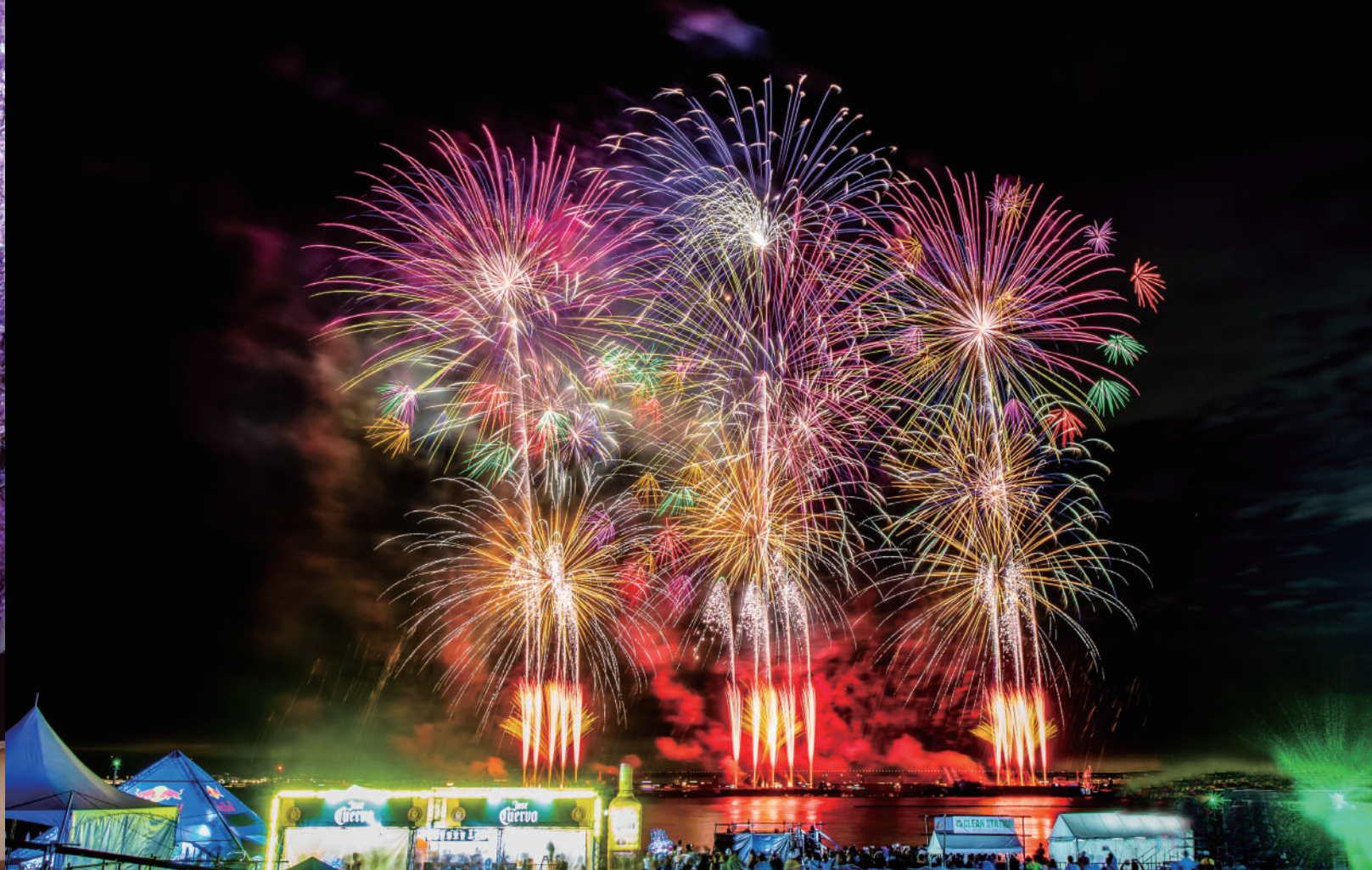
4. Senshu Dream of Lights and Sounds Fireworks Show