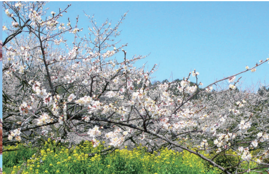
11. Ume blossoms and canola flowers at Kinyuji Bairin (Ume Orchard)