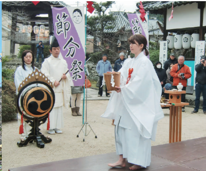
12. Setsubun (traditional seasonal event) at Tanekawa-jinja Shrine

10. Even in this city that does not snow, you will be rewarded with a marvelous winter landscape if it ever happens.