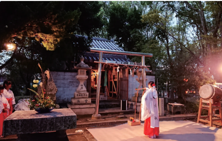
8. Tenjin-no-Mori Forest