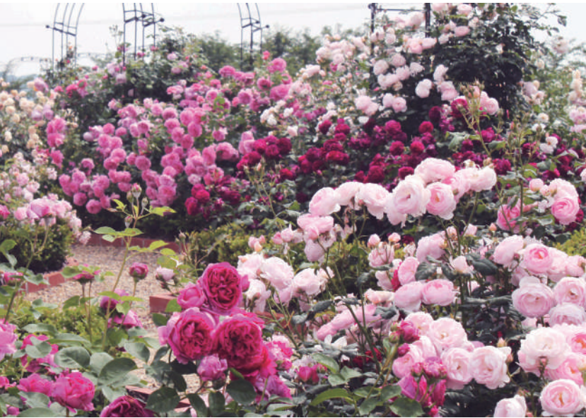
2. English Rose Garden