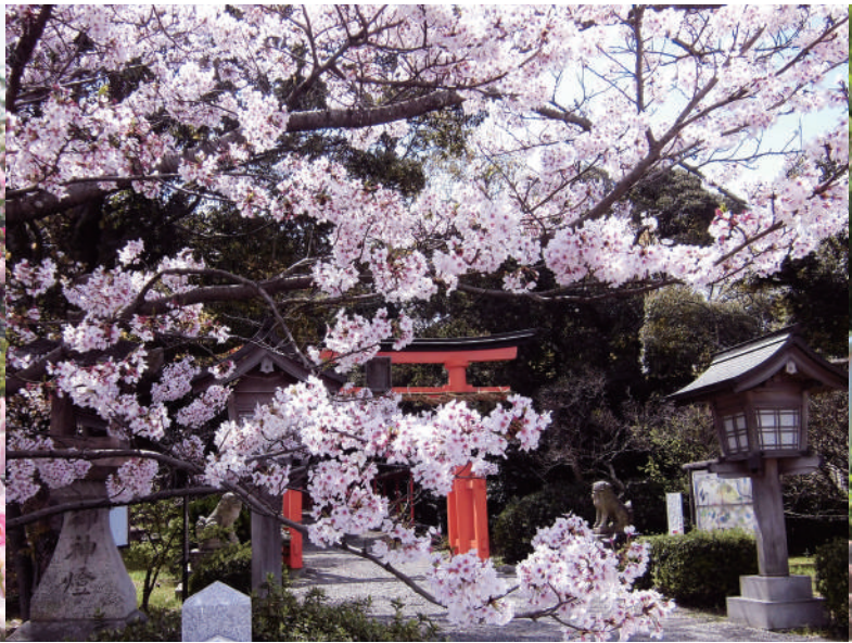
3. Sakuras at Tanekawa-jinja Shrine