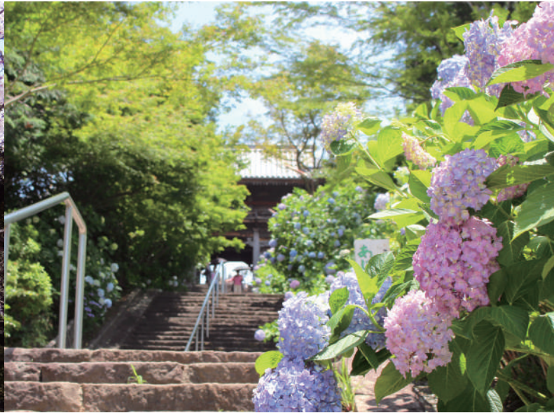
5. Chokeiji Temple's Hydrangeas